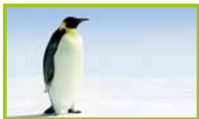
a Emperor Penguin