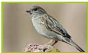
b House Sparrow