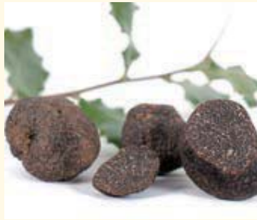
20 truffle 松露