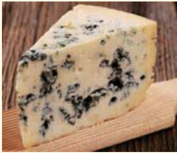
② roquefort 羊乳酪