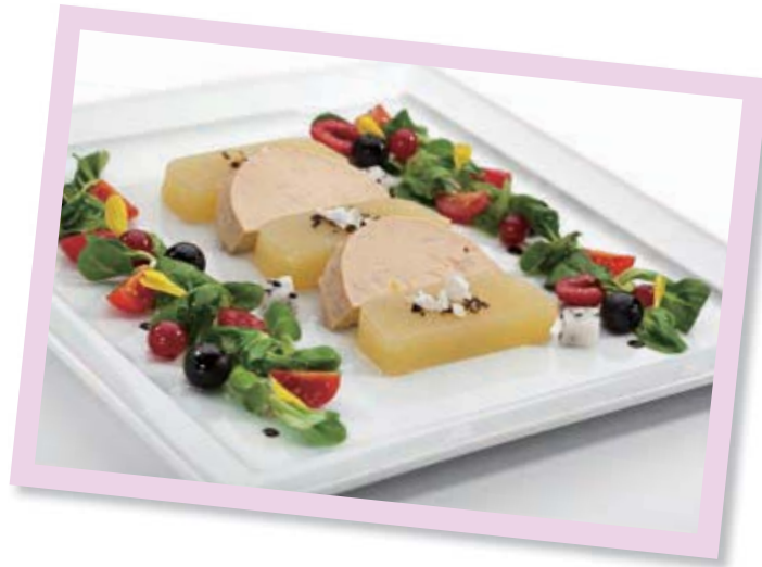
goose liver pie