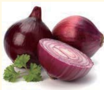
23 raw onion 生洋蔥