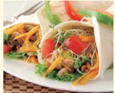
18 wrap 包；裹