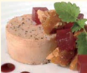
22 goose liver 鵝肝