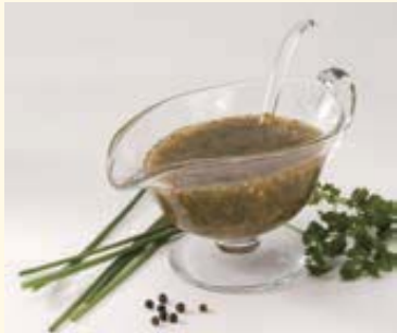
16 vinaigrette 油醋醬