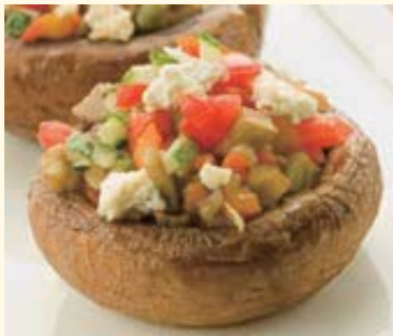
⑧ stuffed 有塞入內餡的