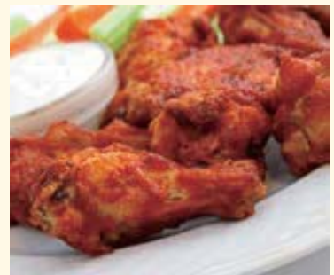
24 buffalo chicken wings 水牛城雞翅