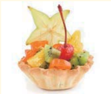
⑦ tart 餡餅