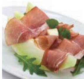
Parma ham with melon