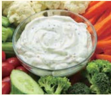
14 ranch dressing 鄉村沙拉醬