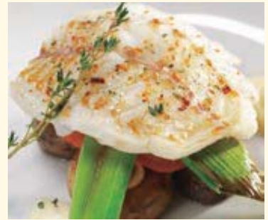
21 halibut 大比目魚