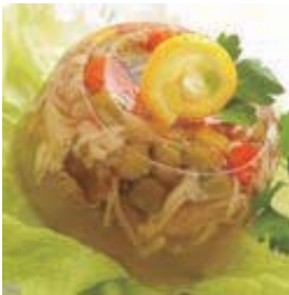
pork in aspic