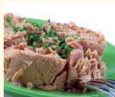
⑥ tuna 鮪魚