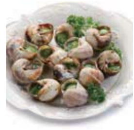
snail in garlic and butter