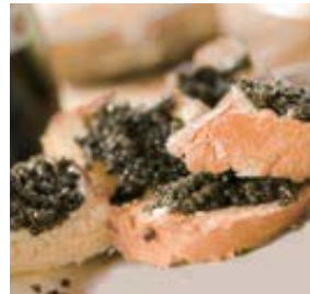
toast with caviar