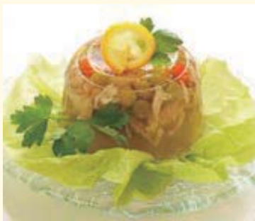
⑤ aspic 肉凍