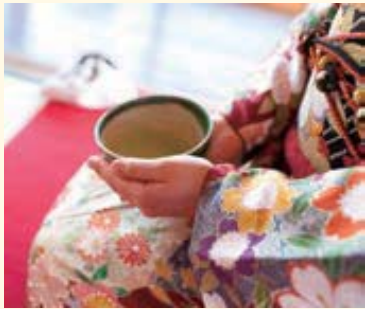
19 traditional 傳統的