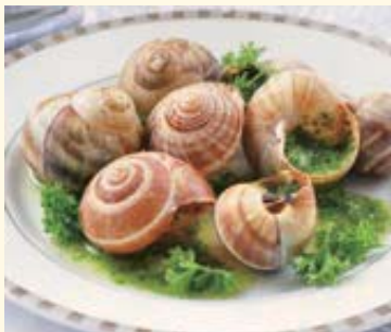
⑪ snail 蝸牛