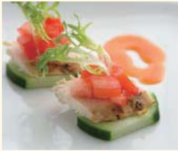
① hors d'oeuvres 開胃小菜 (法) = appetizer