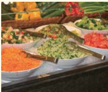
④ salad bar 沙拉吧