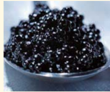
③ caviar 魚子醬