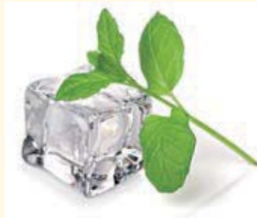
17 refreshing 清新的