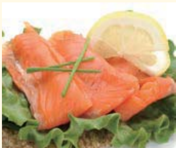
⑩ smoked salmon 煙燻