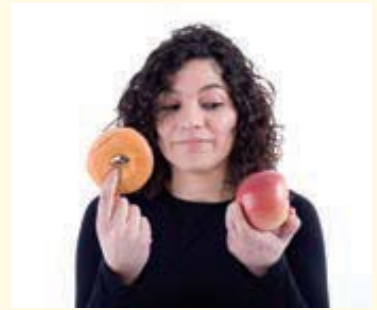
15 option 選擇