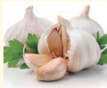
⑫ garlic 大蒜