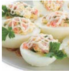
stuffed eggs with trout