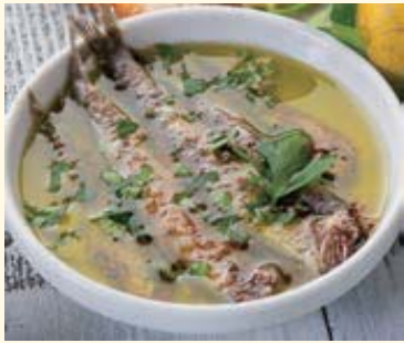
13 sardines in oil 油漬沙丁魚