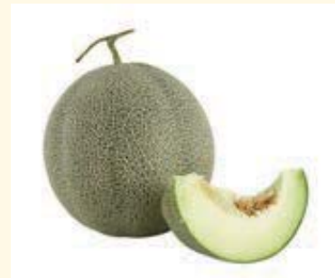
⑨ melon 瓜類