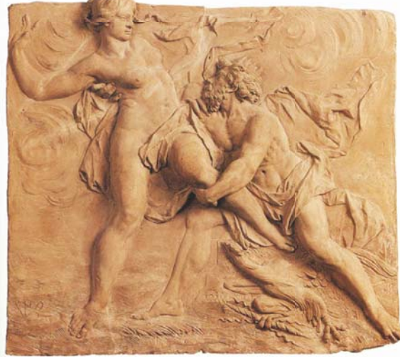
The Abduction of Persephone by Hades

The other brother of Jupiter was a sad pale-faced being, whose kingdom was underneath the earth, where the sun never shone and where there was darkness and weeping and sorrow all the time. His name was Pluto, or Aidoneus, and his country was called the Lower World, or the Land of Shadows, or Hades.