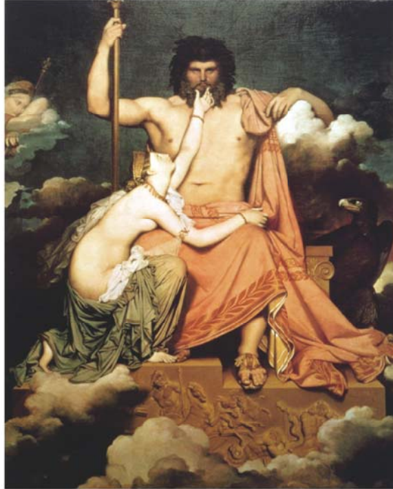
Jupiter and Thetis

He liked to ride on the storm-clouds and hurl 3 burning thunderbolts 4 right and left among the trees and rocks; and he was so very, very mighty that when he nodded 5 , the earth quaked, the mountains trembled 6 and smoked, the sky grew black, and the sun hid his face.