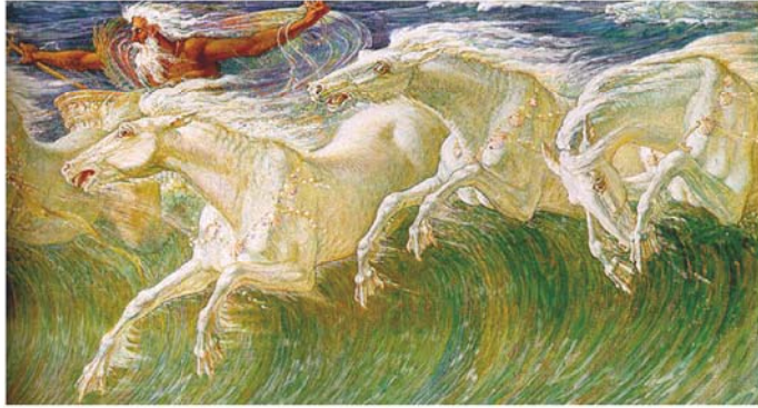
The Horses of Neptune

002) Jupiter had two brothers, both of them terrible fellows, but not nearly so great as himself. The name of one of them was Neptune, or Poseidon, and he was the king of the sea. He had a glittering 7 , golden palace far down in the deep sea-caves where the fishes live and the red coral 8 grows.