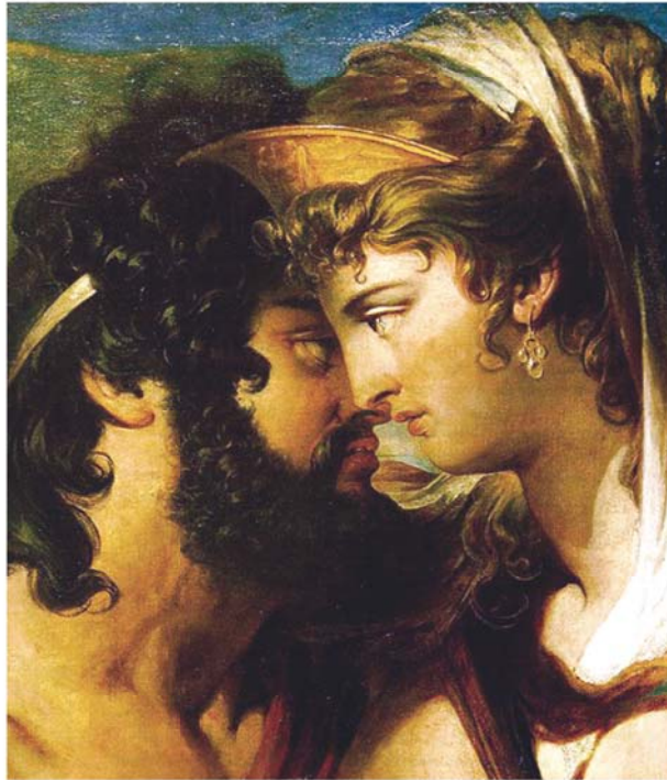
Jupiter & Juno on Mount Ida

001 A long time ago, when the world was much younger than it is now, people told and believed a great many wonderful stories about wonderful things which neither you nor I have ever seen.