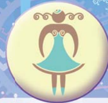
6 Virgo [ˈvɜːɡo] (n.) 處女座