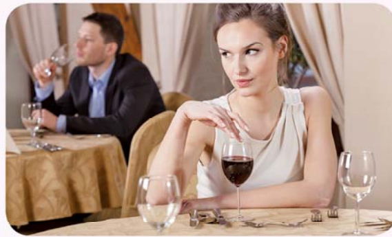
11 single [ˈsɪŋɡl] (a.) 單身的