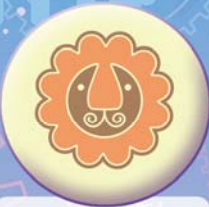
5 Leo [lio] (n.) 獅子座