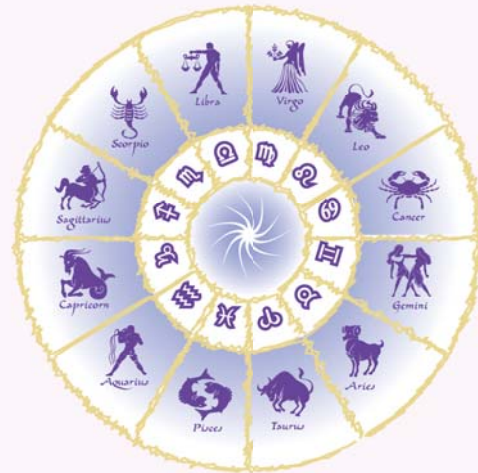
9 (star) sign [saɪn] (n.) 星座