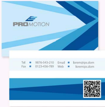
8 business card 名片