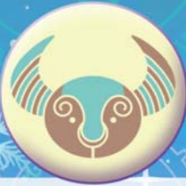
2 Taurus [ˈtɔrəs] (n.) 金牛座