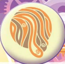
11 Aquarius [əˈkwɛəriəs] (n.) 水瓶座