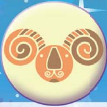
1 Aries [ˈɛrɪz] (n.) 牡羊座