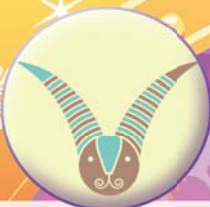
10 Capricorn [ˈkæprɪkɔːn] (n.) 摩羯座