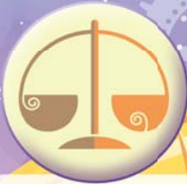
7 Libra [ˈlɪbrə] (n.) 天秤座