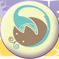
8 Scorpio [ˈskɔːrpi,o] (n.) 天蠍座