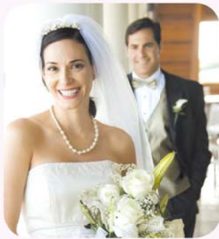
10 married [ˈmæɪrɪd] (a.) 已婚的