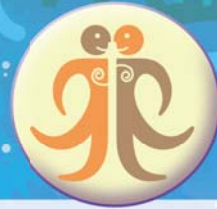
3 Gemini [ˈdʒɛməˌnaɪ] (n.) 雙子座