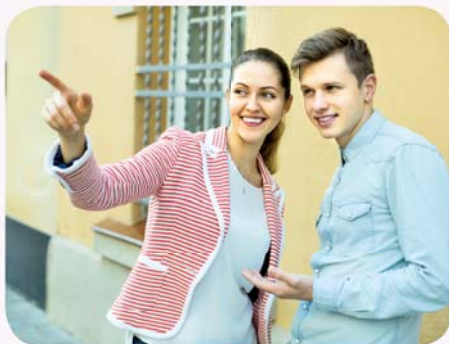
12 friendly [ˈfrendli] (a.) 友善的