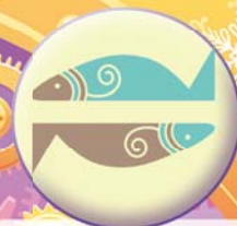
12 Pisces [ˈpɪsɪz] (n.) 雙魚座