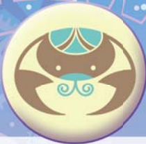
4 Cancer [ˈkænsə] (n.) 巨蟹座