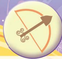
9 Sagittarius [sædʒɪˈtɛəriəs] (n.) 射手座