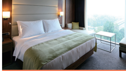
double room 雙人房(一張雙人床)