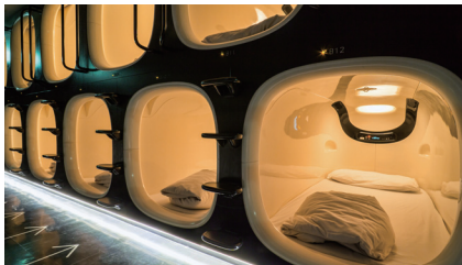
capsule hotel 膠囊旅館