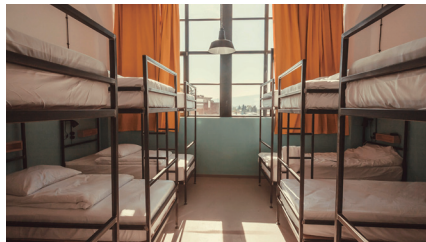
(youth) hostel 青年旅館