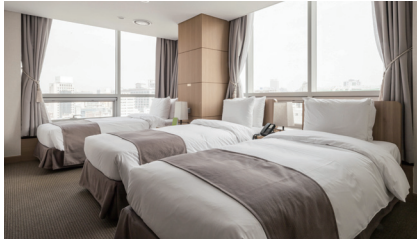
triple room 三人房