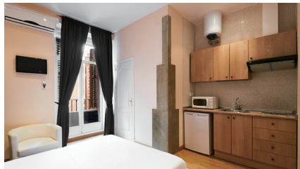
apartment hotel 公寓式飯店