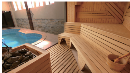
spa hotel 水療旅館