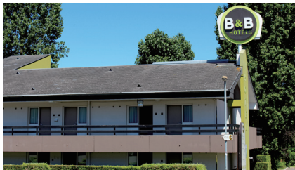
B&B (bed and breakfast) 民宿