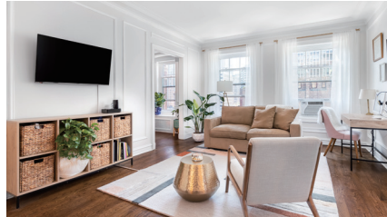
family room 家庭房