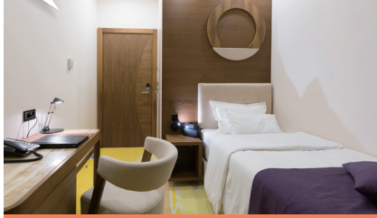
single room 單人房