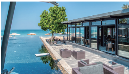
resort hotel 度假旅館