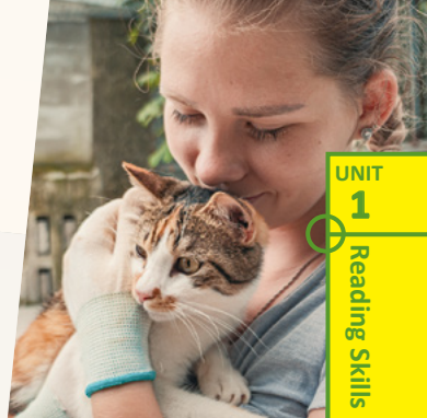
▲ helping at an animal shelter