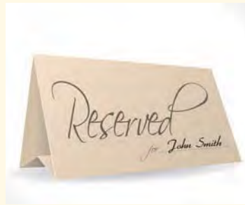
2 in one's name 以某人的名字