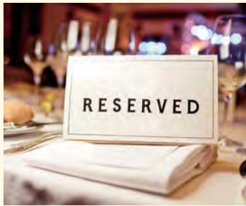
1 reservation ['rɛzə'veɪʃn] 預定