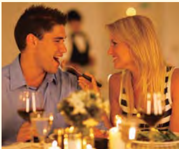
19 candlelit dinner ['kʌndlɪt 'dɪnɹ] 燭光晚餐