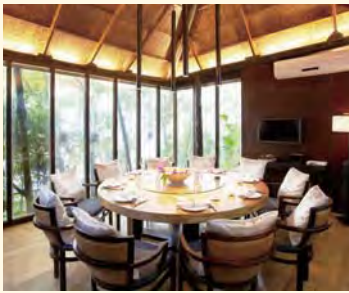
13 private room ['praʊt rum] 私人包廂