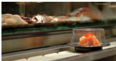
conveyor belt sushi