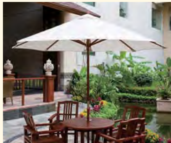
20 patio ['pʌtɪo] 天井；露台