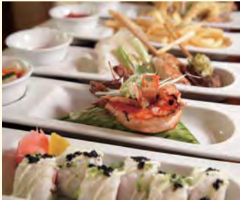
16 cuisine [kwʊzin] 菜餚