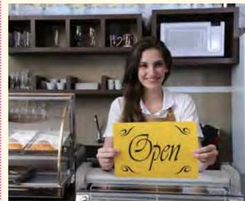
12 available [ə'veɪləbəl] 有空的；開放的