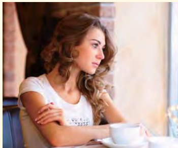
7 hold on ['hɒld ɒn] 稍等