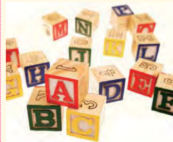
9 spell [spɛl] 拼字