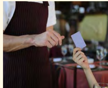
21 service charge ['sɹvʒ tʌrdɪ] 服務費