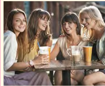
3 party ['pɑːti] 一群人