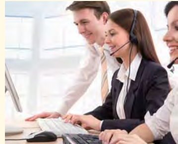
18 transfer [trʌns'fɹ] 轉接