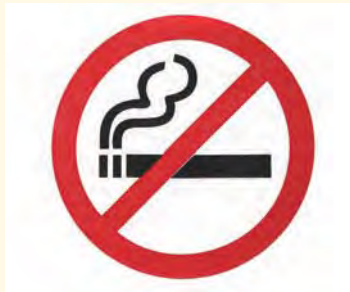
4 non-smoking ['nɒn'smɒkɪŋ] 非吸菸的