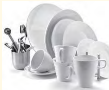
17 tableware ['tebɹwɹ] 餐具