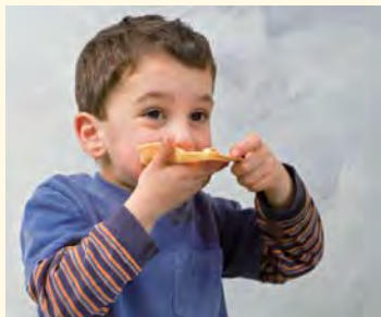
10 full [fʊl] 飽足