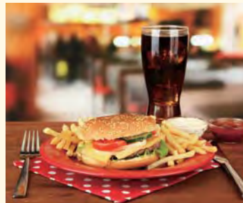
8 set meal [sɛt miːl] 套餐