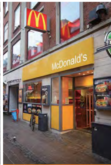
fast food restaurant