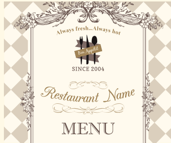
5 menu ['menjuː] 菜單