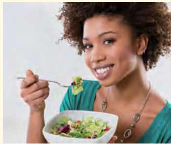
14 vegetarian ['vʒdɪ3'tʒrʊn] 素食者