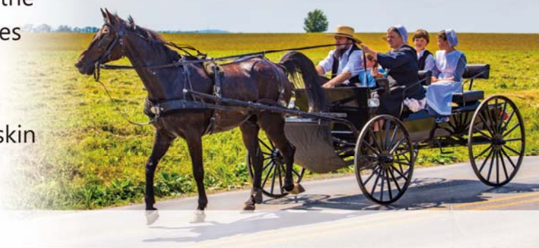
▼ Amish family

5 Not all rites of passage are happy events, at least not for their participants. In the Amazon rain forest, 13-year-old boys of the Sateré-Mawé tribe must spend 10 minutes wearing a pair of gloves with stinging ants woven into them. Other tribes mark adulthood by tattooing young people's skin or filing down their teeth. Ouch!