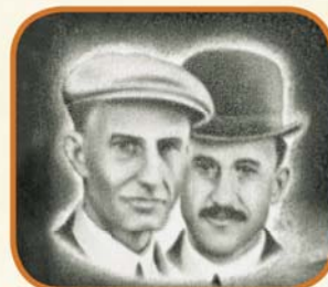
Orville and Wilbur Wright (the Wright brothers)