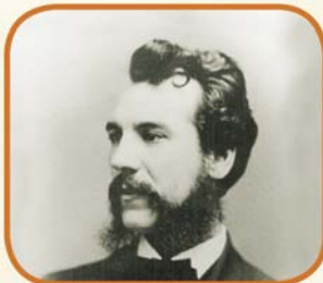
Alexander Graham Bell