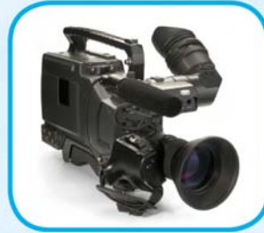
motion picture camera