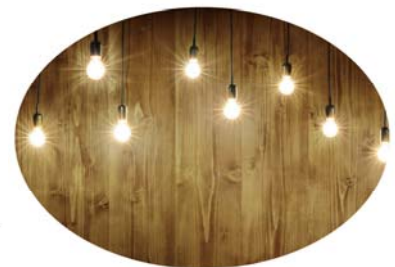
▲ Thanks to electric lights, we can see at night.

Thomas Edison also invented many other things. He made more than 1,000 inventions! His inventions made our lives more convenient.