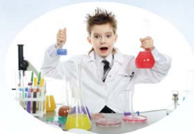
▲ An inventor makes new things.

An inventor makes new things. We call these new things inventions.