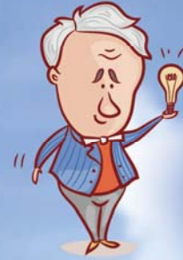
▲ Thomas Edison was a famous inventor.

We turn on a light when it's dark. Do you know who made the electric light? It was Thomas Edison.