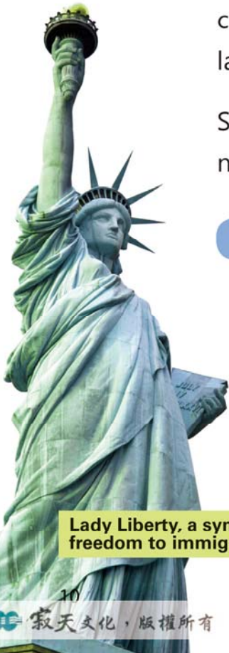
Lady Liberty, a symbol of freedom to immigrants

Many people begin new lives in the United States.