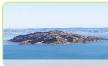
Angel Island in San Francisco Bay