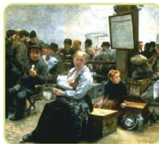
immigrants in the early 1900s