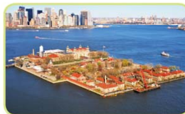
Ellis Island in New York Harbor