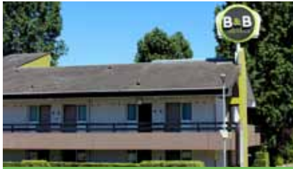
B&B (bed and breakfast) 民宿