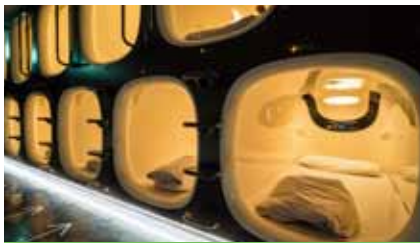
capsule hotel 膠囊旅館