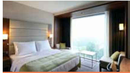
double room 雙人房(一張雙人床)