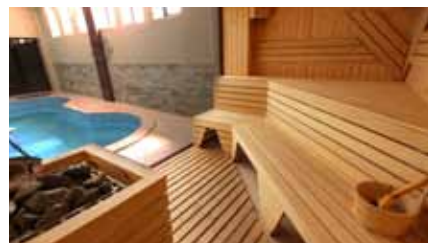
spa hotel 水療旅館