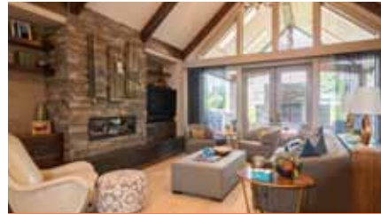
family room 家庭房