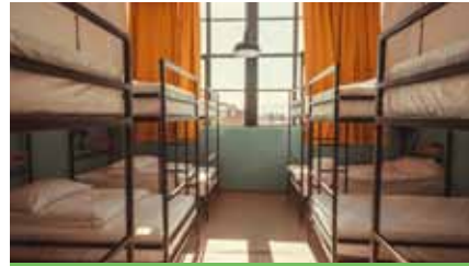
(youth) hostel 青年旅館