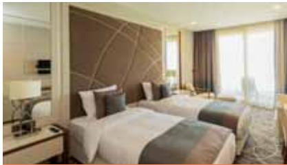
twin room 雙人房(兩張單人床)