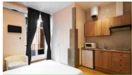
apartment hotel 公寓式飯店