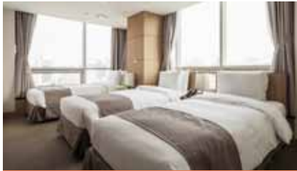
triple room 三人房