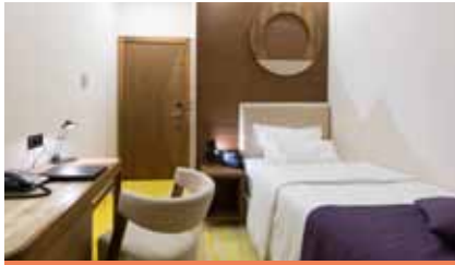
single room 單人房