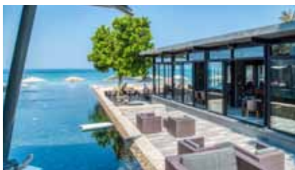
resort hotel 度假旅館