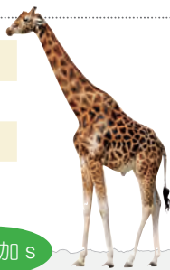
▲ a giraffe