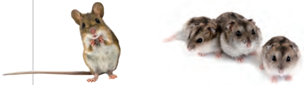
a mouse 老鼠