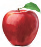
an apple 蘋果