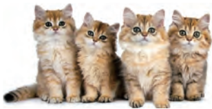
four cats 四隻貓