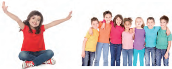
a child 小孩