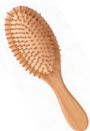
one hairbrush 一支梳子