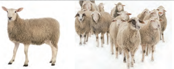
one sheep 一隻羊