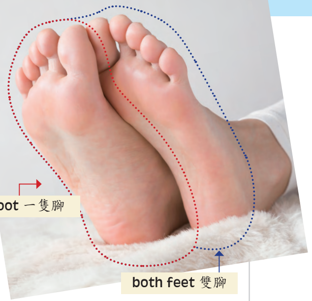
a foot 一隻腳