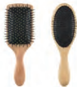
two hairbrushes 兩支梳子