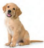
a dog 狗