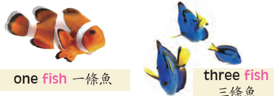
one fish 一條魚

3 魚類的複數形有兩種：fish 和 fishes。指同類魚或泛指魚時，複數形只能用 fish；指多種不同類的魚時，通常也用 fish，但也可以用 fishes。