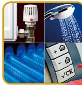
« home utilities