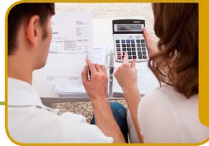
» family budget