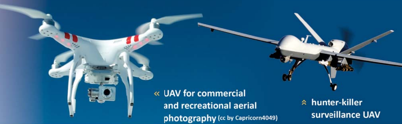
« UAV for commercial and recreational aerial photography (cc by Capricorn4049)