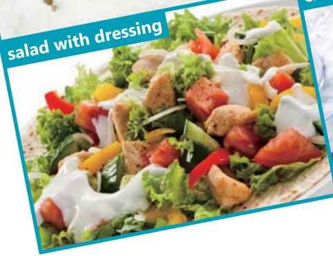
salad with dressing