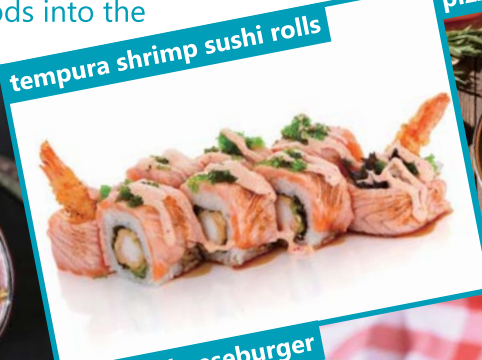
tempura shrimp sushi rolls