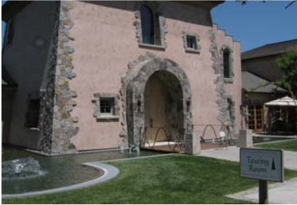
A historic building on the vineyard used as a tasting room

The photos below were taken during a couple's honeymoon in Napa Valley. Write captions (short descriptions) for each of the photos.