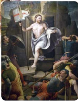
◀ the coming back to life of Jesus

Easter is in late March or early April every year. It is the most important Christian holiday. It is the day when Jesus Christ came back from the dead. Most Christians go to church on this day.