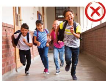
▲ Do not run in the hallways.