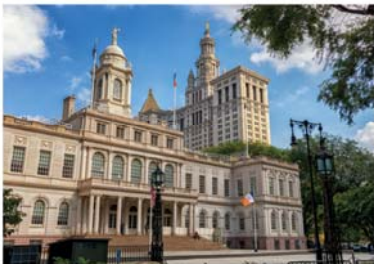
▲ city hall