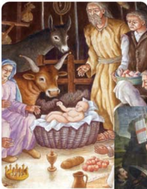
▲ the birth of Jesus

Christmas is on December 25. Christians celebrate the birth of Jesus on this day. Christmas is a time of happiness and celebration.