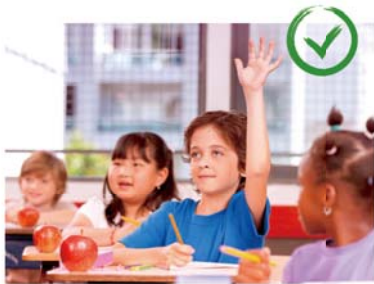
▲ Raise your hand to talk.