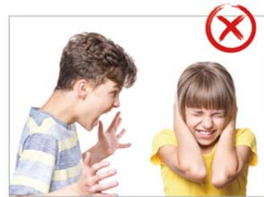
▲ Do not yell and scream.