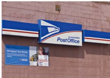
▲ post office