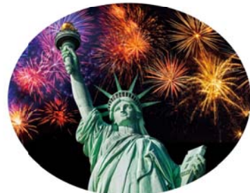
▲ Independence Day