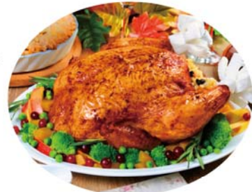
▲ Thanksgiving Day