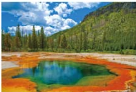
▲ Yellowstone National Park