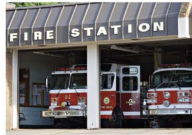
▲ fire station