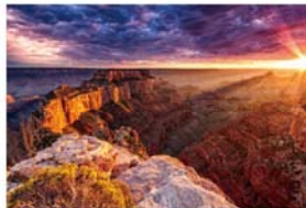
▲ Grand Canyon National Park