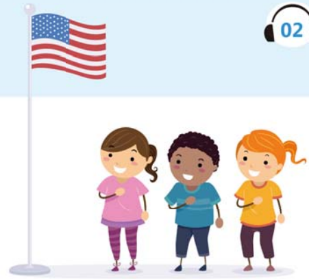
▲ the Pledge of Allegiance

John and Sally go to elementary school. Their first class starts at 8 a.m. They go to their homeroom. They stand up, face the flag, and say the Pledge of Allegiance before their class begins. Then their teacher, Mrs. Smith, starts their lessons. They study math, social studies, English, and art, and then they go to the cafeteria for lunch. After lunch, they have recess, so all the students go outside and play for a while. Then they learn science, history, and music. Finally, it's 3 o'clock. It's time for them to go home!