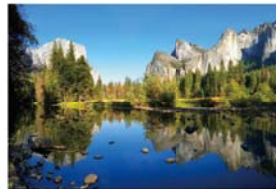
▲ Yosemite National Park