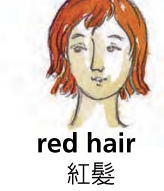
red hair 紅髮

She had a lot of long, beautiful hair. 她有一頭長而美麗的秀髮。