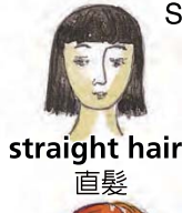
straight hair 直髮