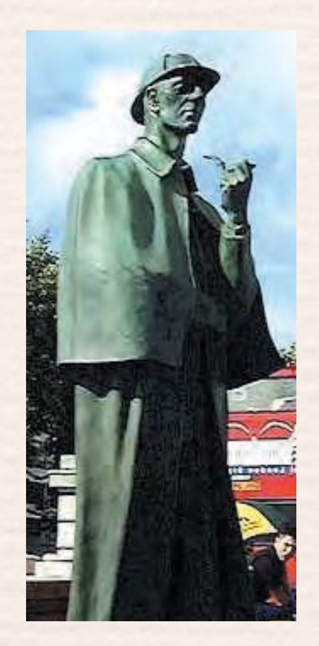
The Statue of Sherlock Holmes

If you could meet Holmes, you would see a tall, thin man, about 185 centimeters in height<sup>1</sup>. Holmes